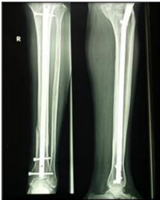
X-ray after infiltration