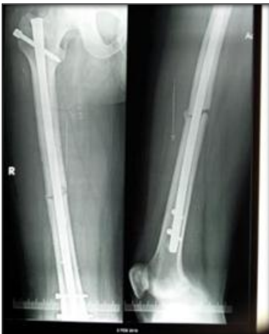
X-ray for Pre-Infiltration