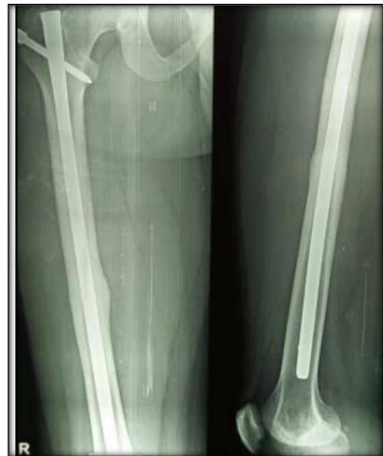
X-ray after infiltration