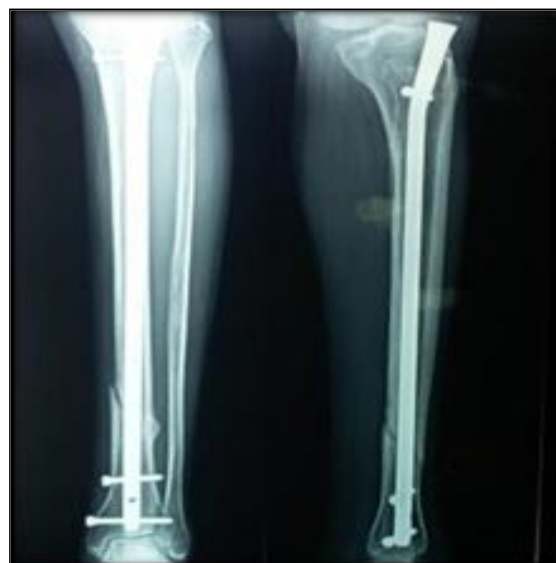
X-ray for Pre-Infiltration