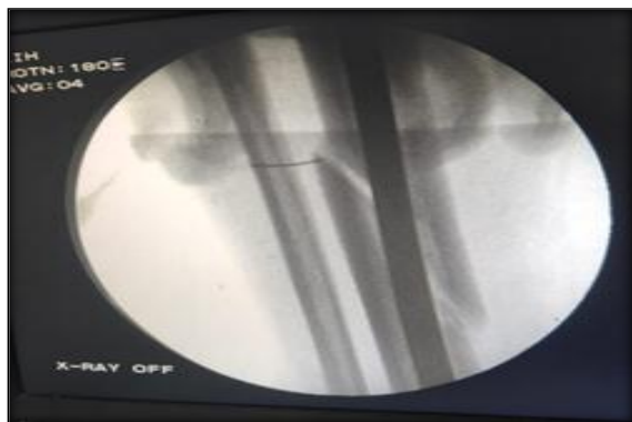
Figure 1: Infiltration of PRP